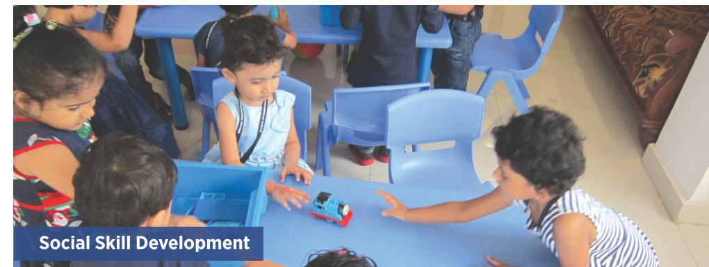
Social Skill Development