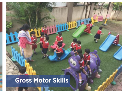
Gross Motor Skills