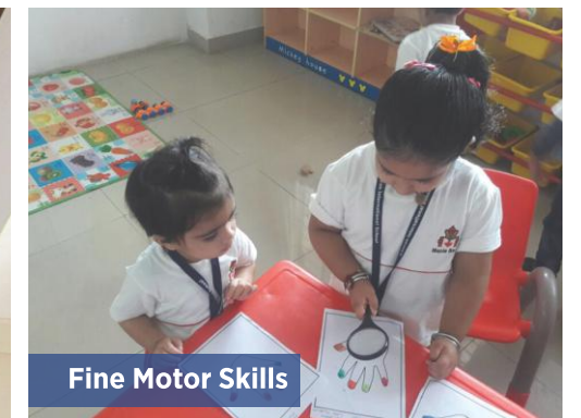
Fine Motor Skills