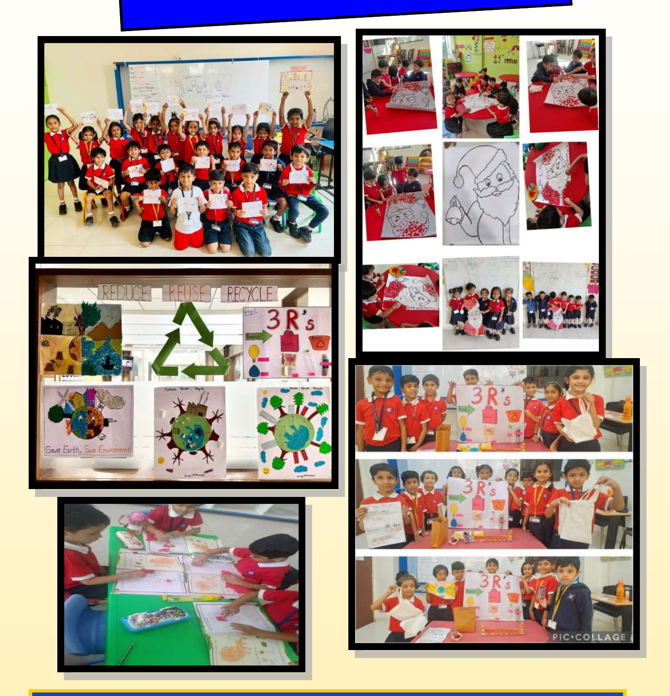
Preschool-age children are learning to master both gross motor skills (which involve large physical movements) and fine motor skills (such as manual dexterity and hand-eye coordination).