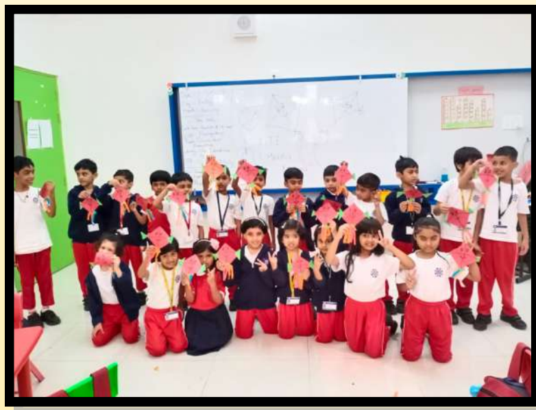
Kite making Activity.