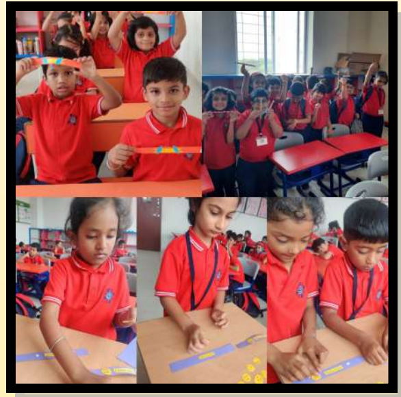
Friendship band making Activity