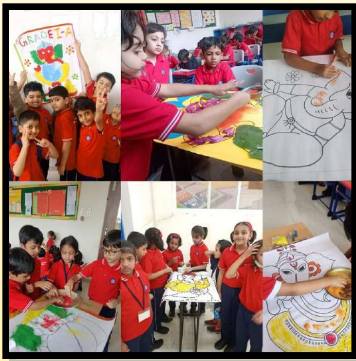
Ganesh Idol making Activity.